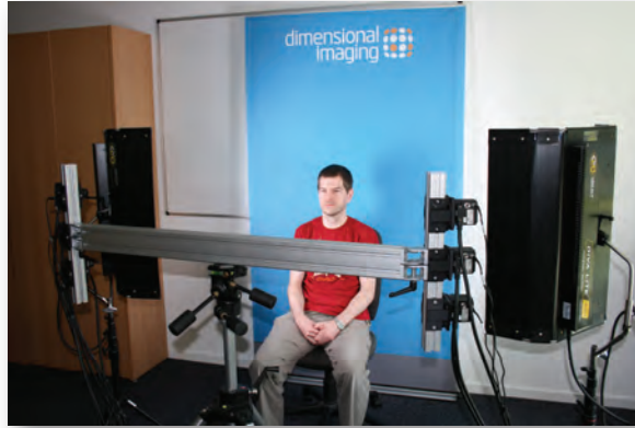
Multi-camera recording rig with audio and LTC time code