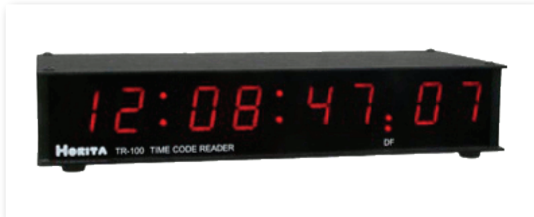
Image LTC time stamping within StreamPix